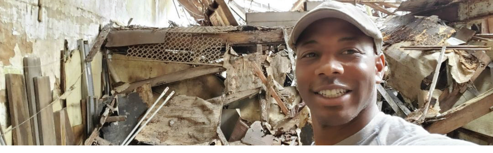
Changing the Landscape