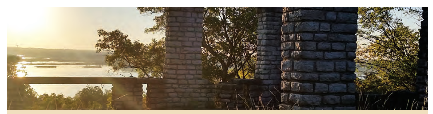
CCC Broadview Overlook at the Fort Worth Nature Center & Refuge.